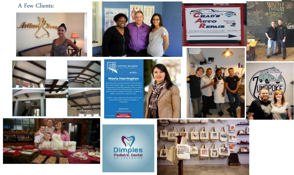
A Few Clients: